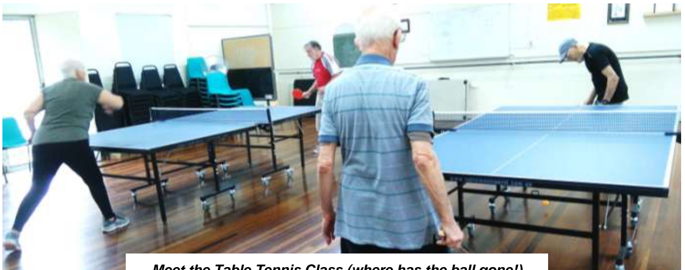
Meet the Table Tennis Class (where has the ball gone!)