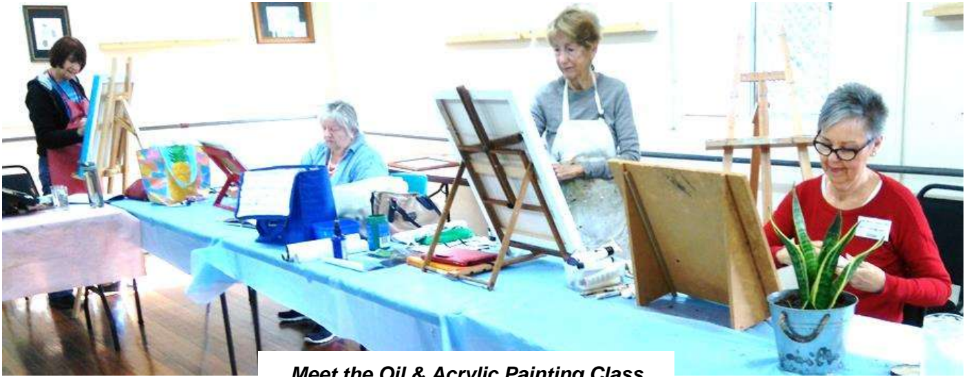
Meet the Oil & Acrylic Painting Class