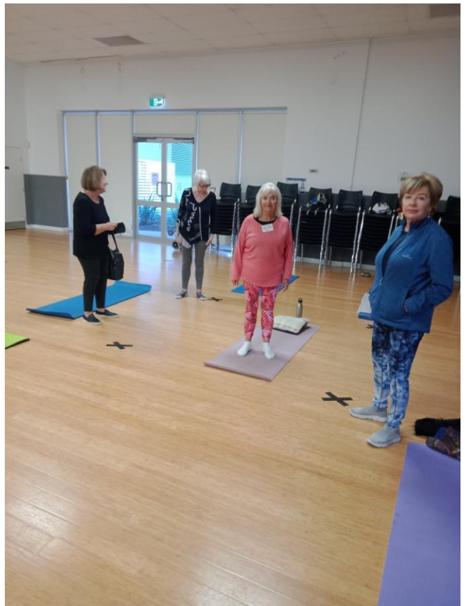
The Yoga Class practising their Social Distancing